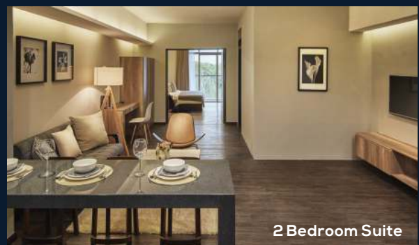
2 Bedroom Suite

Limited units with either a combination of King size bed in one room and Queen or Twin beds in the other room. Sharing the same suite does not mean you don't get to have any privacy. You get to have someone as your company and enjoy your own space at the same time.